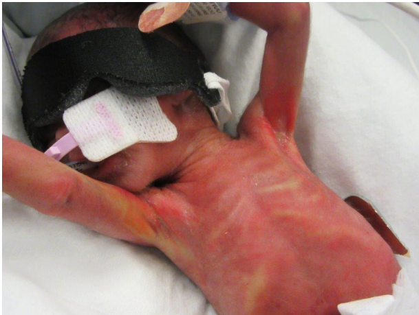
Fig 5. Case 2 - rash on day of life 2

Blood cultures on day of life 9 and 10 were positive for candida albicans and fluconazole 12 mg/kg/day intravenously was initiated on day of life 10. The skin at this time was dry and peeling over the entire body and scalp. The blood cultures remained positive for candida albicans for the next 5 days, despite the candida being sensitive to fluconazole. On day of life 16 fluconazole was discontinued and amphotericin B 1 mg/kg/day intravenously was started.