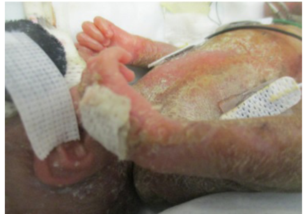
Fig 7. Case 5 - rash on day of life 7

associated with eye discharge. On day of life 4, the rash extended over the entire body and fluconazole 12 mg/kg intravenously daily was started. Skin scrapings and placenta culture were positive for candida and therefore she was considered to have congenital candida infection. On day of life 6, her skin began sloughing and she became clinically unwell. She was lethargic and febrile, therefore a full septic work up was completed. The blood culture was positive for Escherichia coli , requiring a 14 day course of cefotaxime. A head ultrasound obtained during treatment did not show evidence of fungal balls. For the yeast infection, she received a 10 day course of fluconazole. Once she recovered she was transferred to another health authority before discharge.