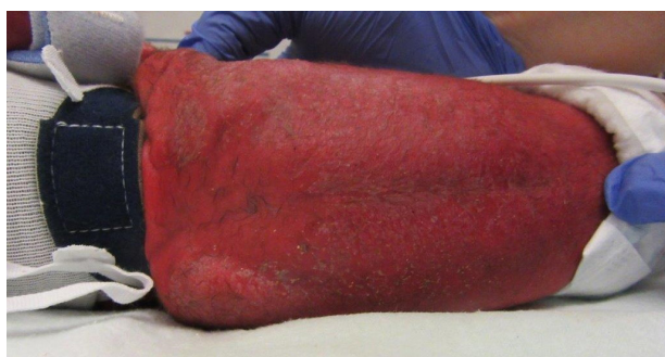
Fig 1. Case 1 - rash day 1 of life

DOL = day of life; CSF = cerebral spinal fluid