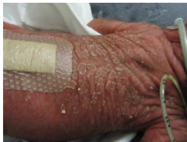
Fig 3. Case 1 - rash day of life 14

Case 2 was born at 23 + 1/7 weeks gestation with a birthweight of 696 grams via emergency caesarean delivery for suspected abruption.