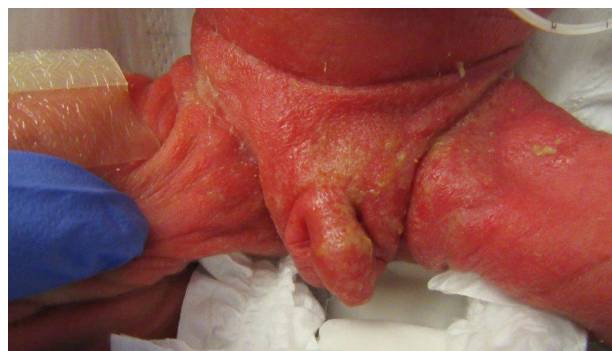
Fig 2. Case 1 - rash day of life 4