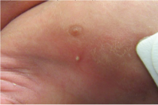
Fig 4. Case 1 - rash day of life 34

5) On subsequent days, the rash spread to the rest of the body with many areas having open skin lesions. On day of life 6, the skin was dry and peeling.