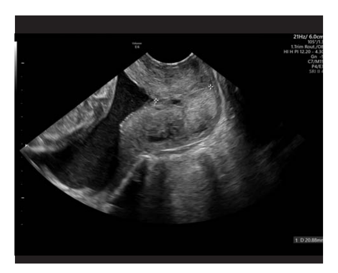
Fig. 2. 20 mm cervical length.

After ST, the patient readmitted to the hospital with vaginal bleeding at 21 weeks of gestation. She had powerful uterine contraction and the ultrasonographic examination revealed that cervical length was 20 mm (Fig. 2). Antibiotherapy (ampiciline+sulbactam IV 2 g/4id per day for 48 h followed by PO 375 mg/2id for 5 days plus azithromycin PO 500 mg per day for 7 days) and tocolysis (indomethacin rectal 100 mg once, followed by PO 25 mg/4id for 2 days) were started. Despite antibiotherapy and tocolysis, after fourth day of therapy, amniotic leakage occurred and the dead twin A was delivered normally with full dilated cervix but the placenta of dead twin A was not delivered. On the absence of infection parameters, McDonald-Shirodkar cerclage were carried out after the delivery of the dead twin A under antibiotherapy and tocolysis. The patient was daily followed up with blood and clinic infection parameters. The patient was discharged and weekly followed up at the outpatient clinic. 15 days after cerclage, the patient readmitted with abdominal pain and vaginal bleeding. She had powerful uterine contraction and cervical length was 23 mm at 25 weeks of gestation. Antibiotherapy and tocolysis were started again as described above. Antenatal corticosteroids (betamethasone IM 12 mg/d for 48h) were administered to enhance fetal lung maturity. Magnesium sulfate for neuroprotection with a loading dose of 4 g IV