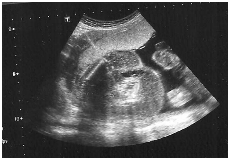
Fig. 2. Intrafetal alcohol injection procedure under the guidance of color Doppler ultrasonography

The goal of antepartum management of a twin pregnancy complicated by the TRAP sequence is to maximize for the structurally normal pump twin. Because of the increased demand that the abnormal circulation in TRAP sequence places on the heart of the pump twin, cardiac failure is the primary concern in the condition. Various techniques have been described to accomplish the blocking of arterial perfusion of acardiac twin. These methods have included hysterotomy with physical removal of the acardiac twin, bipolar coagulation, laser ablation, radiofrequency ablation, ultrasound-guided injection of thrombogenic materials into the umbilical circulation of the acardiac twin, and laser occlusion of the placental vascular anastomosis under fetoscopic guidance. [5-8] On the other hand, Malone et al. have suggested that expectant management with