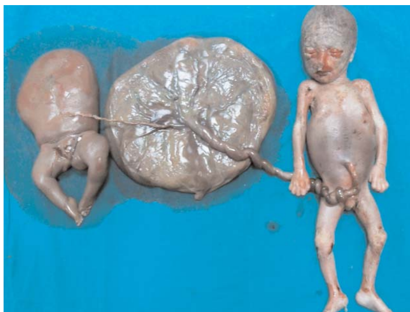
Fig. 3. The acardiac twin, pump twin and monochorionic diamniotic placenta. [Color figure can be viewed in the online issue, which is available at www.perinataljournal.com ]

serial ultrasonographic evaluation is reasonable in the absence of poor prognostic features (twin weight ratio >0.70 , elevated ventricular out-put of pump twin, increased cardio-thoracic ratio, congestive heart failure, rapid growth of the pump twin and polyhydramnios). [7] In the present case, the twin weight ratio was 0.88 and polyhydramnios was diagnosed by antenatal sonography. Surgical treatment was decided after a discussion with the patient about the expected poor perinatal outcome of the current pregnancy. The difference in estimated fetal weight between the pump twin and the acardiac/acephalic twin has been suggested the main predictive determinant of the perinatal outcome in cases with TRAP sequence. In the series of 49 cases reported by Moore et al., the mean overall ratio of the twin weights was found to be 52 \pm 24\% . [4] When the ratio was more than 70%, the incidence of preterm delivery was 90% and congestive heart failure in the pump twin 30%, as compared with 75% and 10%, respectively. The overall perinatal mortality was 55% and was primarily associated with prematurity. Sullivan et al., however reported 10% perinatal mortality rate of the cases with TRAP sequence. They cautioned against aggressive surgical intervention and recommended conservative management although weight ratio of acardiac to pump twin was less than 5% in 40%