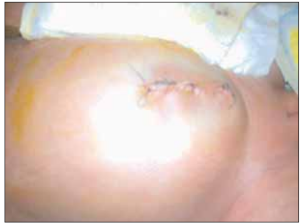
Figure 3. Omphalocele. Post-operative view.