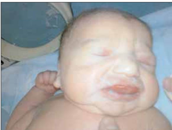
Figure 4. Macroglossia.