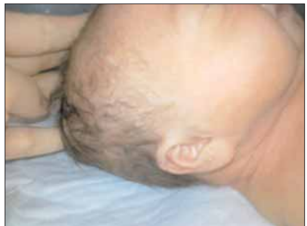
Figure 5. Ear lobe anomaly.

diography was normal. The case is been following for development of embryonal malignancies.