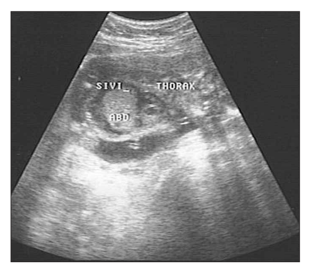
Figure 1. Ultrasonographic appearance.

clinic. In family history, there wasn't any baby with anomalies or marriage with a relative. There was no exposure to teratogen drugs and chemical agents during pregnancy. In ultrasonographic evaluation, edema in fetal subcutaneous tissue, ascites, hypoplasia in thorax, and pericardial effusion were determined (Figure 1). Fetal biometric measurements were consistent of 16 weeks gestation. Fetal bradicardy was determined. Fetal heart rate was 80 beats/minute. Rh isoimmunisation and diabetes weren't found. Parvovirus B16 IgM antibody was negative. The case was presented at the council of perinatology and making amniocentesis and termination of the pregnancy were advised to the family. Pregnancy was terminated after amniocentesis by family consent at 18th weeks of gestation. Karyotype was normal (46,XY) as a result of genetic amniocentesis. A 200 grams, 19 centimeters, hydropic, non viabl, male fetus was delivered (Figure 2). Autopsy findings included hypoplastic lungs, bilaterally bilobated, with bilaterally hyparterial bronchi. Levocardia was established. The examination of the heart revealed that the atrial situs showed left isomerism, both atria and ventricules were equal sized, foramen ovale was closed at atrial septa, ventricular septal defect and atrioventricular valves were normal, atrioventricular connection was concordant. Abdominal wall was