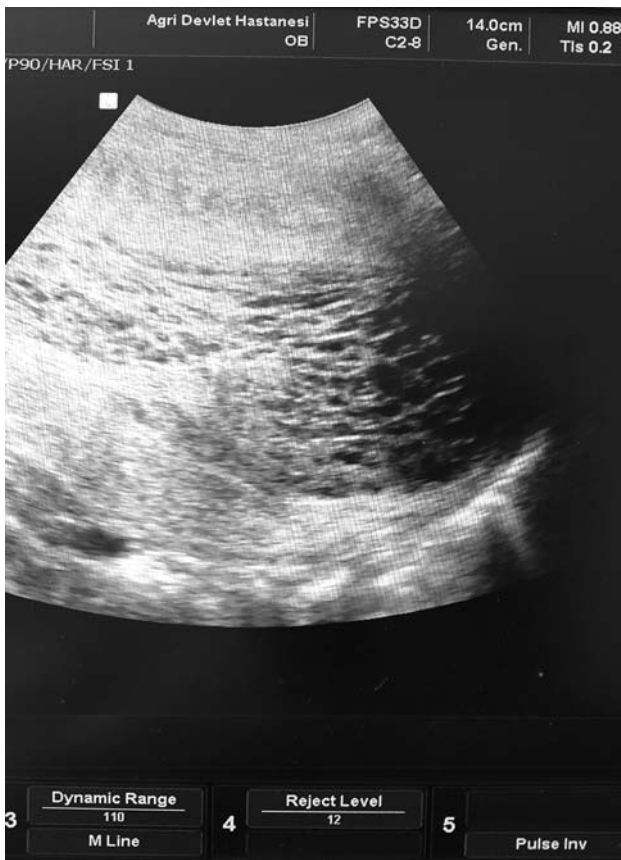
Fig. 1. The ultrasonographic image of placenta.

Twenty-five-year-old patient who was multigravida and at 18 weeks of gestation according to her last menstrual period applied to our clinic with high blood pressure