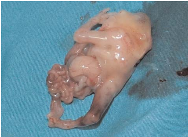
Fig. 2. The view of fetus where the heart is observed out of the thorax and the bowel was observed out of the abdominal cavity.

The etiology of the syndrome is not known completely, it is considered that it appears due to the incapability of mesoderm during the migration on mid-even ventromedial direction at early embryonic phase. [7] Apart from that, it is stated that it may occur due to mechanical teratogenicity effect associated with chorionic or yolk sac rupture. [8] In the etiological studies, it has been reported that thoracoabdominal syndrome gene is associated with Xq22-Xq27 or Xq25-Xq26 region according to DNA analyses. [9,10] However, X-inherited heredity due to mutations in localized genes in X chromosome may be in question in some familial cases. [11] Yet, no specific genetic disorder has been revealed completely to explain the etiology by this time. Most of the cases are sporadic cases where there is no familial predisposition as in our case.