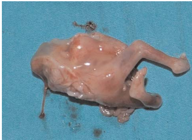
Fig. 3. The view of fetus where acrania and neural tube defect are observed.

The prognosis in the pentalogy of Cantrell depends on the level of cardiac anomaly, and the presence and intensity of other accompanying anomalies; however, the syndrome is mostly considered as lethal. The syndrome may sometimes be accompanied by other anomalies related with other systems. While vertebral anomalies are reported in some cases, [12] vertebral anomalies with pes equinovarus are reported in some cases. [6] Alanbay et al. reported cleft palate and lip, upper limb hypoplasia, pes equinovarus and vertebral anomaly together with the pentalogy in a 16-week-old pregnancy. [13] Other anomalies reported with the pentalogy are the anomalies associated with neural tube defect. [14] Polat et al. reported the presence of cranio-rachischisis in two out of three prenatally diagnosed